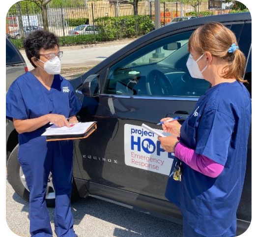
Project HOPE is supporting long-term care facilities in the City of Chicago and Cook County to reduce COVID-19 infection risks.